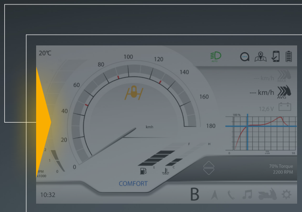
BLIS - BLIND SPOT INFORMATION SYSTEM (ONLY ON MP3 530 HPE)