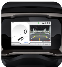
REVERSE AND REAR CAMERA