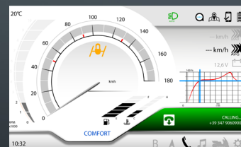
SMARTPHONE CONNECTIVITY (ONLY ON MP3 530 HPE E MP3 400 S)