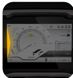
BLIND SPOT INFORMATION SYSTEM