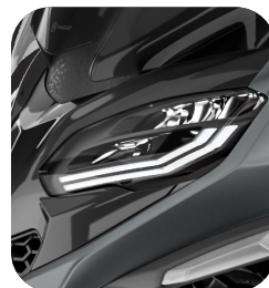
LED DRL HEADLIGHTS