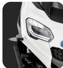
NEW FULL LED HORIZONTAL LIGHT CLUSTER