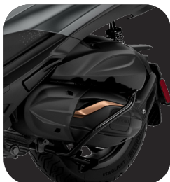
530 HPE EURO 5+ ENGINE