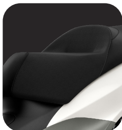
NEW COMFORT SADDLE