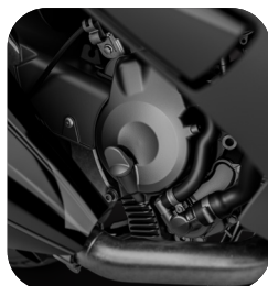
400 HPE EURO 5+ ENGINE