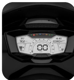
WIDE INSTRUMENT PANEL WITH 5" LCD DISPLAY