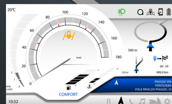
NAVIGATION SYSTEM (ONLY ON MP3 530 HPE E MP3 400 S)