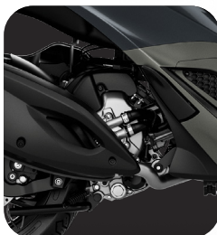
NEW 310 HPE EURO 5+ ENGINE