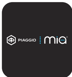
ADVANCED CONNECTIVITY WITH THE PIAGGIO MIA ON BOARD SYSTEM AS STANDARD