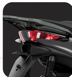
REAR LED LIGHT CLUSTER