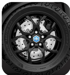
RIMS WITH A NEW DESIGN FEATURING FIVE SPLIT SPOKES